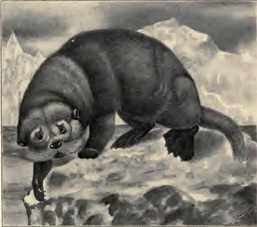
FIG. LIX. LATAX LUTRIS. NORTHERN SEA OTTER.